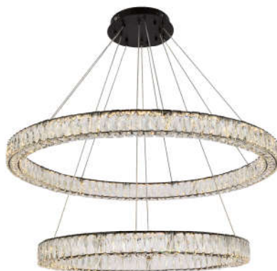
Black Item No:3503D42BK