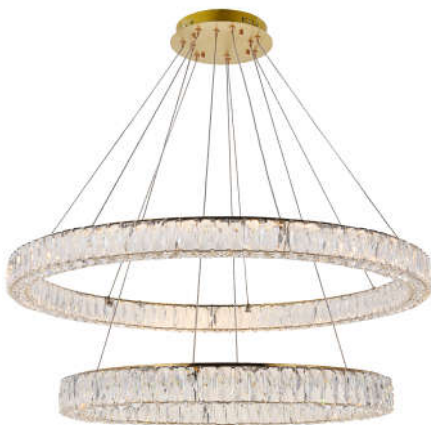
Gold Item No:3503D42G